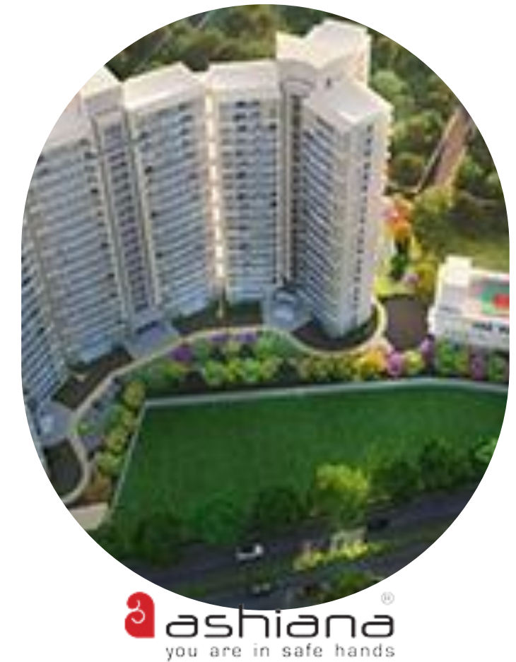
ONE44 Jagtpura, Jaipur, India