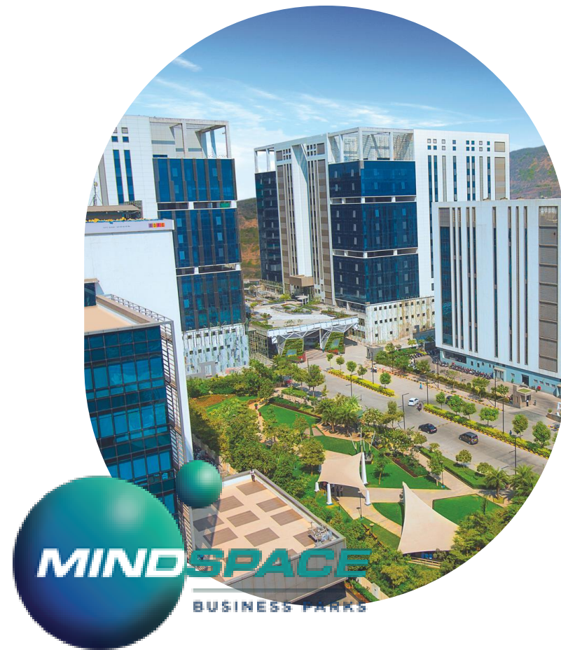
MINDSPACE - Aeroli West Mumbai, India