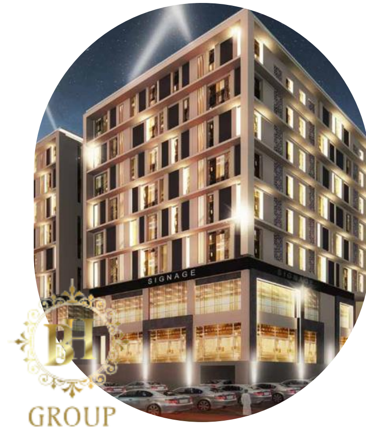
Al Farhidi Tower - BBH GROUP Muscat, Sultanate of Oman