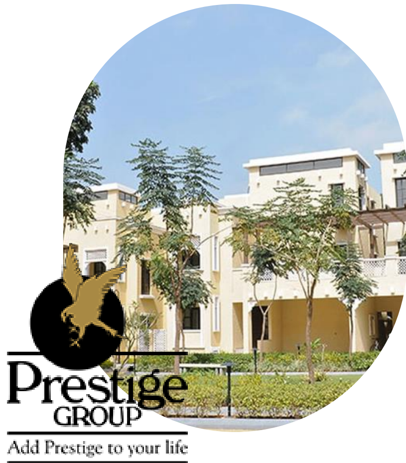
PRESTIGE SILVER OAK - Bengaluru, India