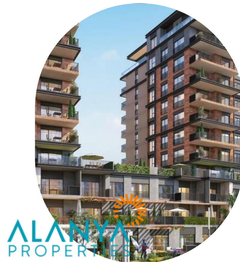
The Country Style Istanbul, Turkey