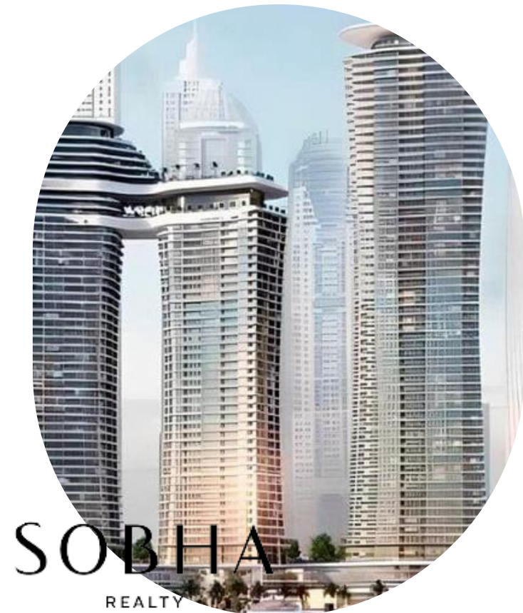
SOBHA SEA HAVEN Dubai, Harbour (UAE)